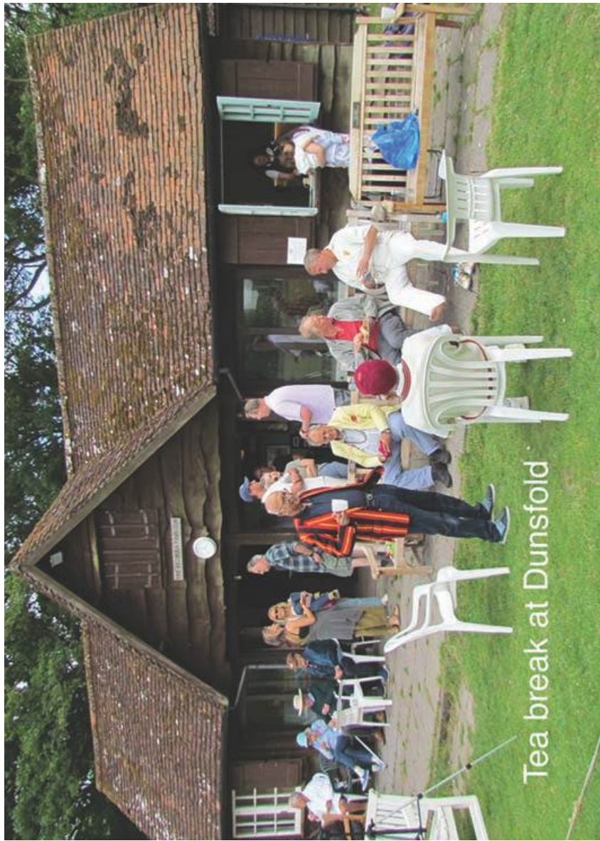
Tea break at Dunsfold